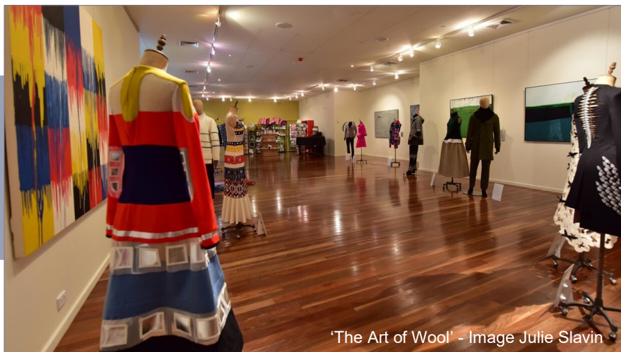
'The Art of Wool'