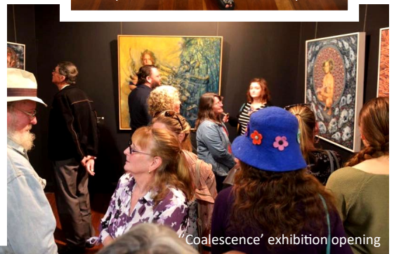
'Coalescence' exhibition opening