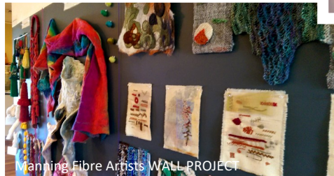
Manning Fibre Artists WALL PROJECT