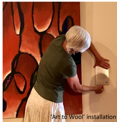
'Art to Wool' installation